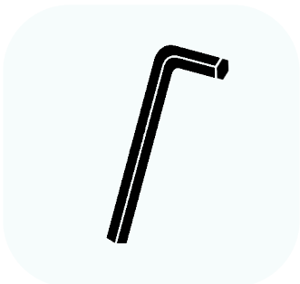
ALLEN WRENCH (INCLUDED)